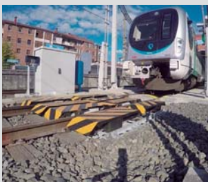
1. Dynamic measuring system