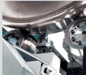
3. Smart reprofiling